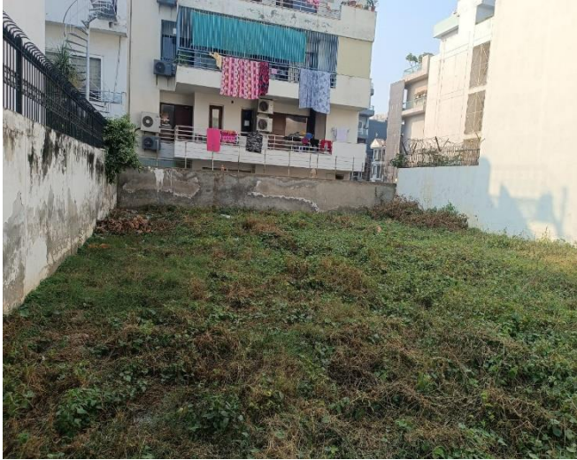
Image of DLF Qutab plot No. 03