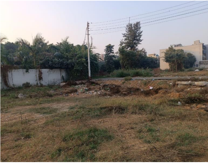
Image of 1126 Property